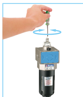
Adjusting oil spray

Use screw driver to adjust oil spray. Turn oil adjusting screw clockwise to decrease oil spray. Turn oil adjusting screw counter-clockwise to increase oil spray.