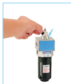
The way to fill oil

Use screw driver to adjust oil spray. Turn oil adjusting screw clockwise to decrease oil spray. Turn oil adjusting screw counter-clockwise to increase oil spray.