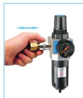
How to use sleeve valve

Open oil plug, fill oil directly without cut off air supply. ISO VG32 lubricator oil is highly recommended. *For (UL02~08)